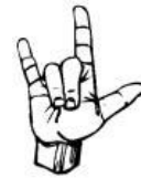
I love you

Although ASL is different to New Zealand Sign language (NZSL), this sign is recognised by people the whole world over. The "I Love You" sign (handshape) blends the handshapes for the letters I, L and Y into one. In the USA celebrities and politicians use it and fashionable tee shirts have it. They have even produced a postage stamp, a signing Barbie doll, and shaped soaps with the handshape!