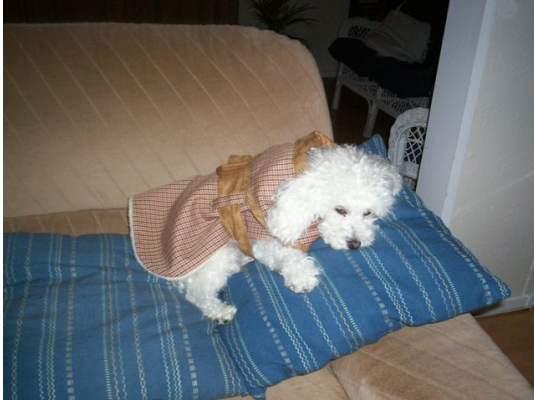
- Sniffing for clues!

Hi, I'm Edith, the Real Special mascot. Well, although the weather has become colder here in New Zealand, this is not the reason I have my Sherlock Holmes cape on.